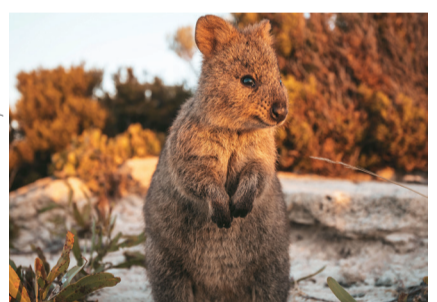
ROTTNE ISLAND, WA