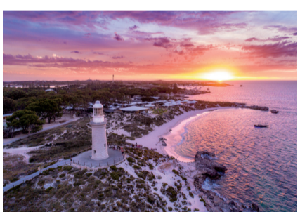
ROTTNE ISLAND, WA