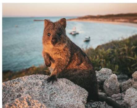
ROTTNEEST ISLAND, WA