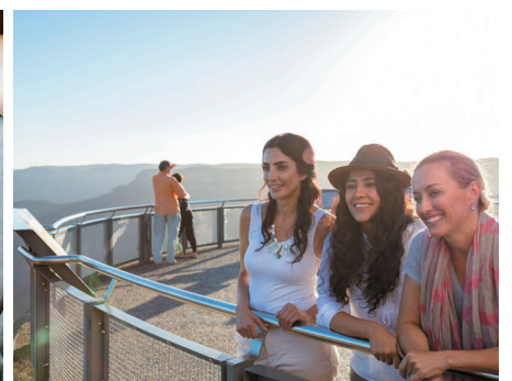
BLUE MOUNTAINS, NSW