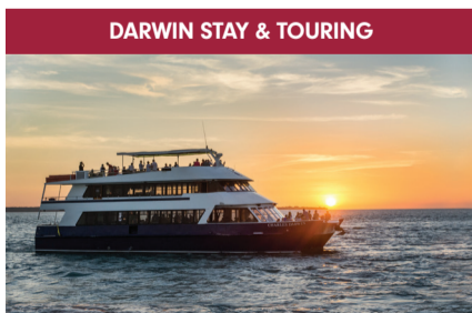
DARWIN STAY & TOURING