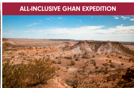
ALL-INCLUSIVE GHAN EXPEDITION