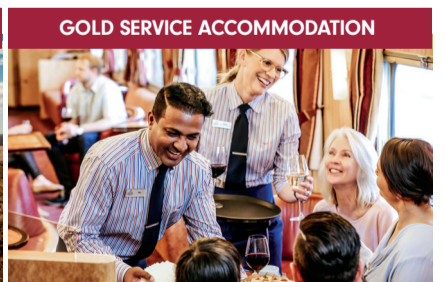
GOLD SERVICE ACCOMMODATION